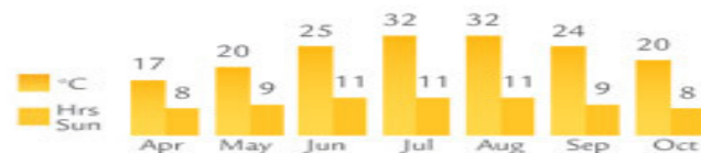
Temperature °C (High) / Sun Hours

Late June / early July is a beautiful time of year to visit the region. The weather is almost always warm but not as hot as high summer.